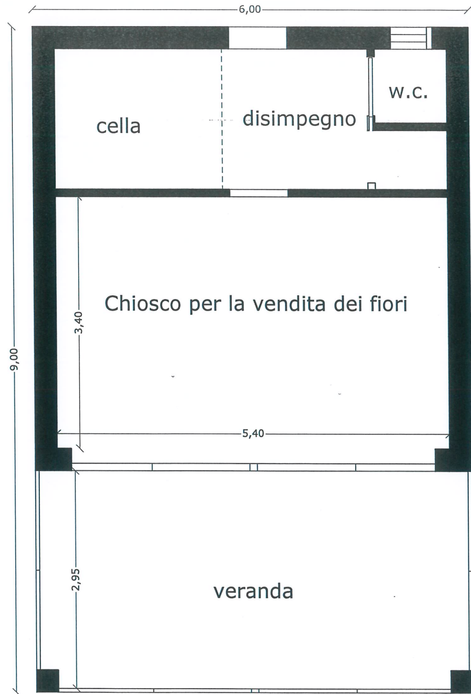
PIANTA PIANO TERRA